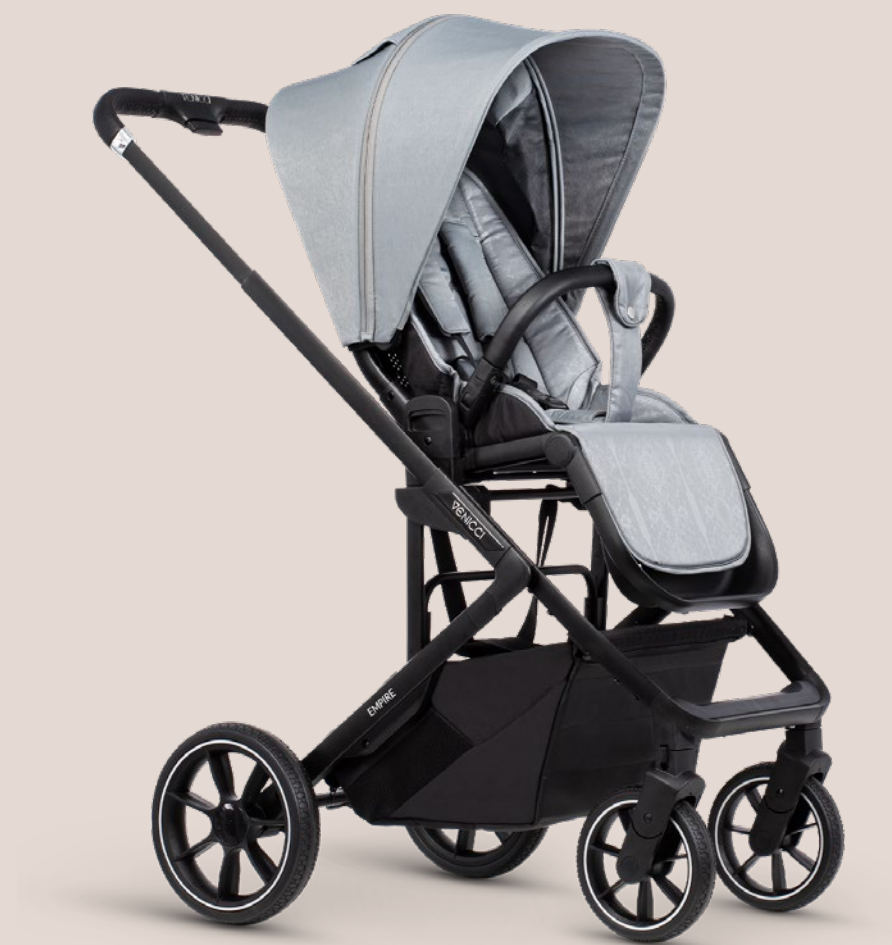
Empire Urban Grey