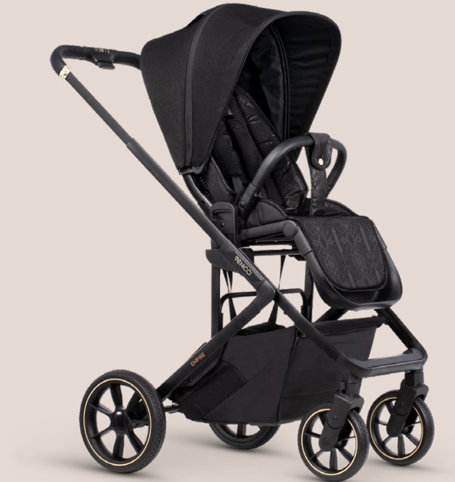
Empire Ultra Black