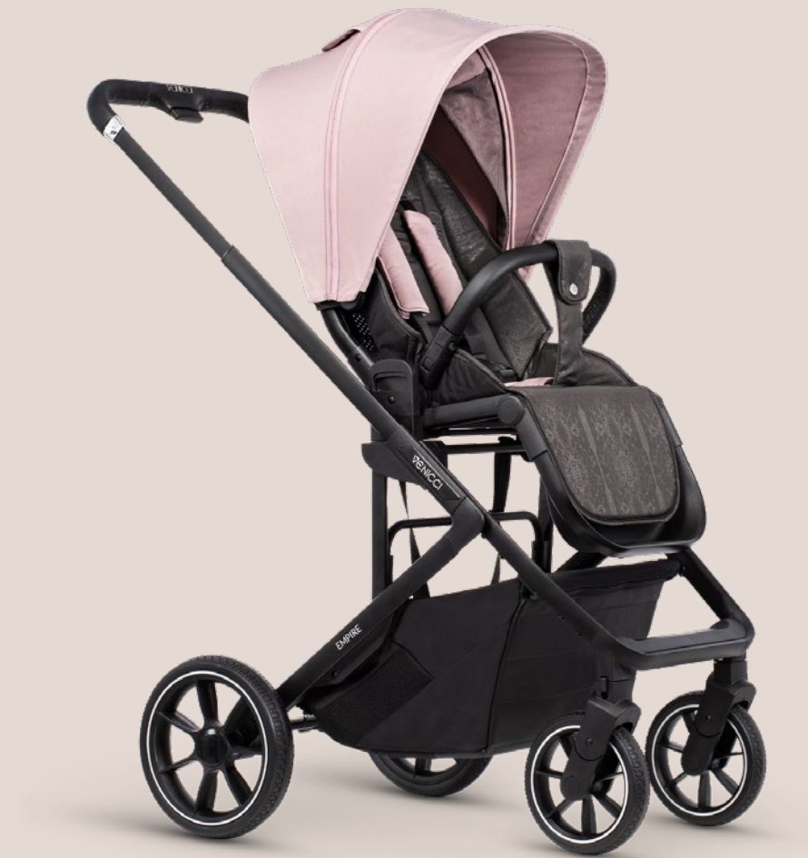
Empire Silk Pink